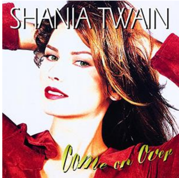
North American cover

Shania Twain has been my idol ever since I was a little girl. My mom and I use to listen to this album together all the time! She has worked so hard to get where she is.