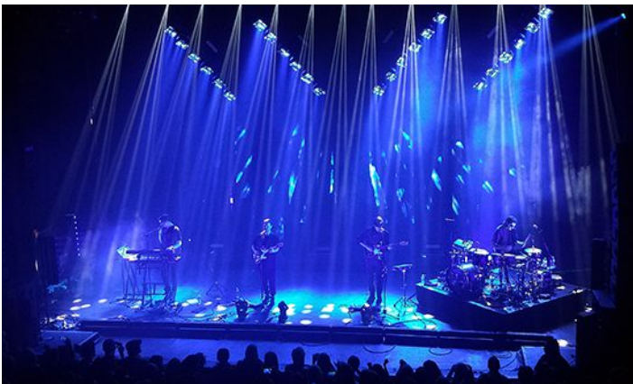
An example of the band's crazy light shows.