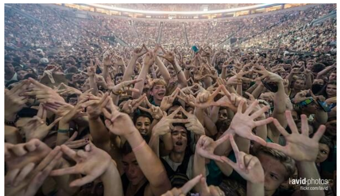
The band's delta trademark, being shown by the dedicated fans.