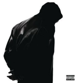
Newman's feature, on The Clams Casino album 32 Levels