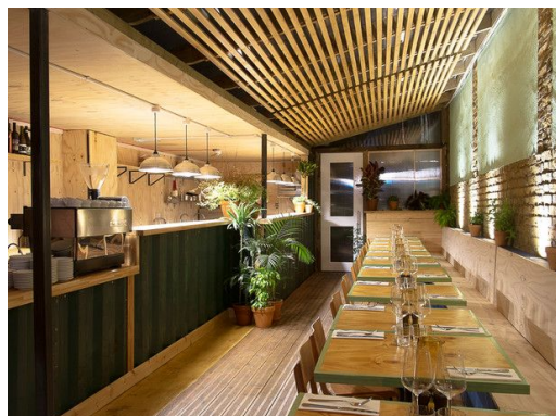
Unger-Hamilton's Cafe " The Dandy " in Fields, East London, formed from an old shipping container lot