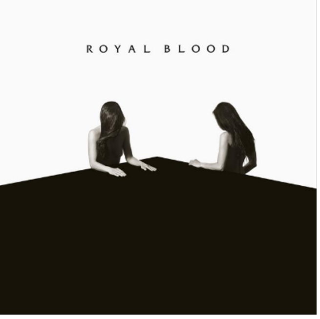
How Did We Get So Dark?