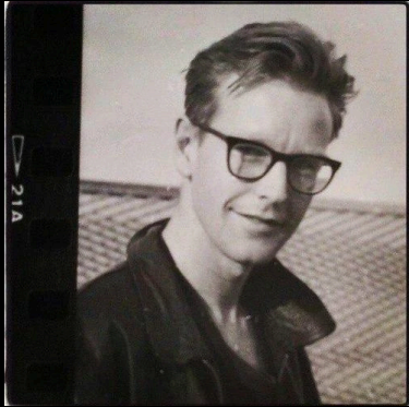
Andrew Fletcher: Keyboard player