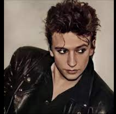
Alan Wilder: Arranger, Producer, Synth player